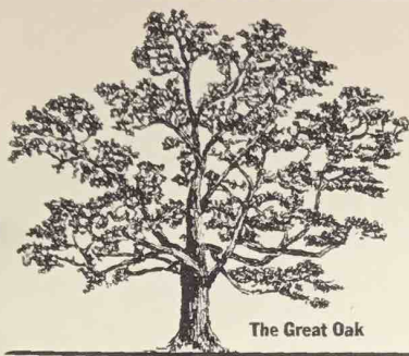
The Great Oak